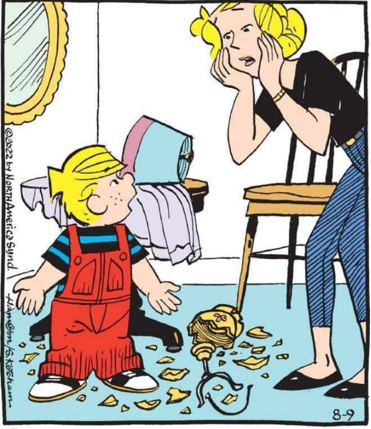
"Well, 19 THERE ANYTHING NICE IN THE HOUSE THAT DOESN'T BREAK?"